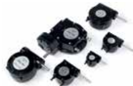
Output Torque 5,310 to 70,000 lb-in