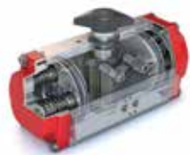
Output Torque 50 to 44,130 lb-in at 80 psi