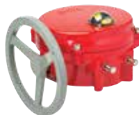
Output Torque 300 to 18,000 lb-in