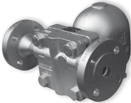
Capacity Chart GTH12